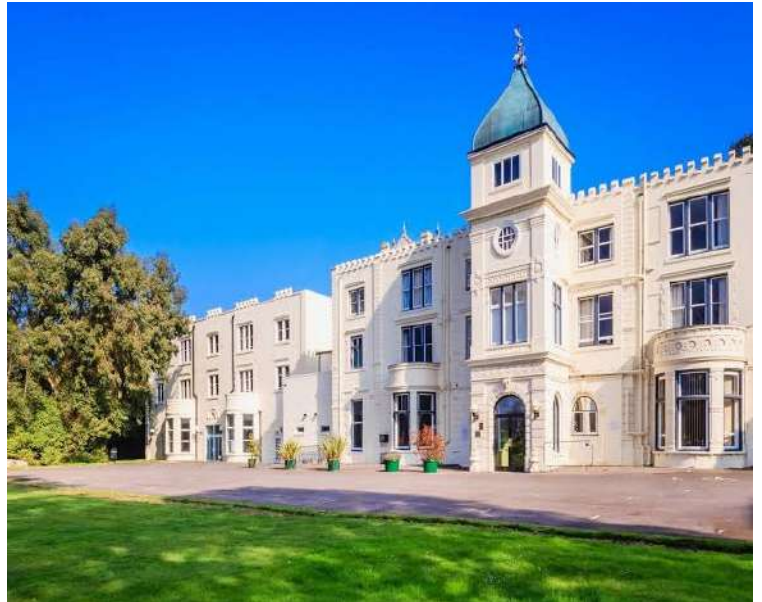
Botleigh Grange Hotel.

Contact Angie Farrington on 02380844588 for reservations.