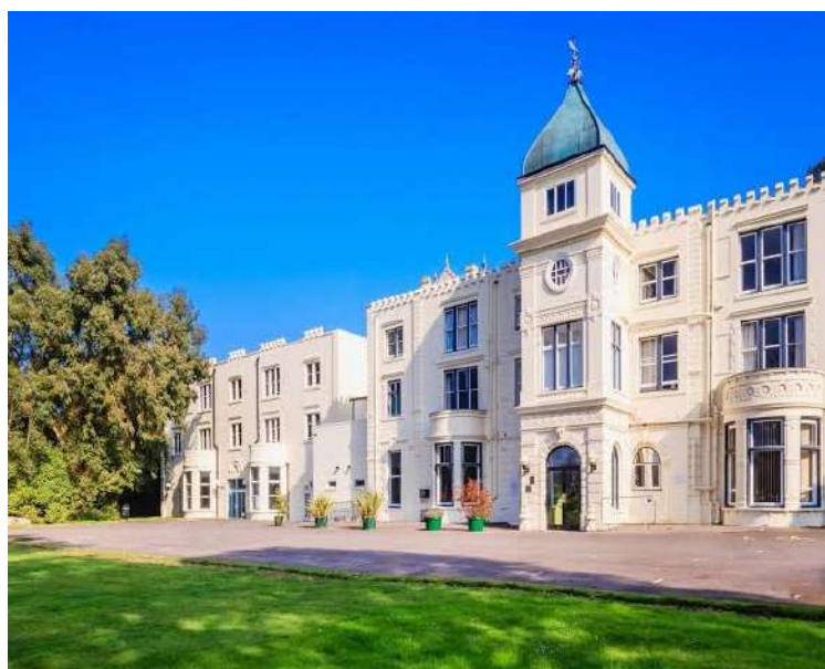
Botleigh Grange Hotel.

Contact Angie Farrington on 02380844588 for reservations.