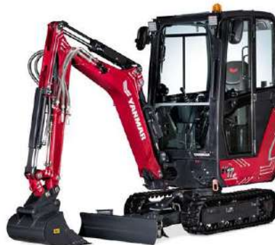
Yanmar's prototype SV17e mini excavator.

The company said the new livery, replacing the previous yellow, brings its compact machines in line with Yanmar Group's corporate design and reflects its forward strategy.